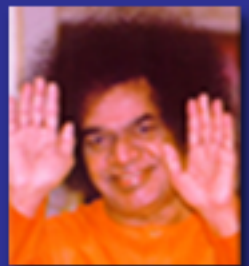
Love All. Serve All.

45 11 Smart Street * Flushing, NY 11355 * (718) 461-0454 * info@omsaimandir.org * www.omsaimandir.org