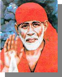
Sabka Maalik Ek