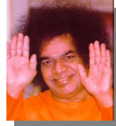
Love All, Serve All

The newsletter is available online at: www.omsaimandir.org