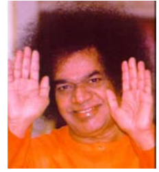
Love All, Serve All

The newsletter is available online at: www.omsaimandir.org