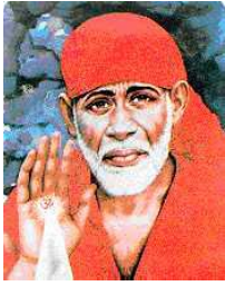
Sabka Maalik Ek