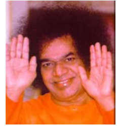
Love All, Serve All

The newsletter is available online at: www.omsaimandir.org