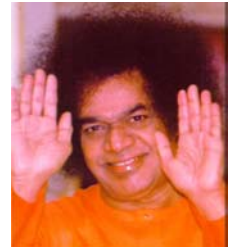
Love All, Serve All

The newsletter is available online at: www.omsaimandir.org