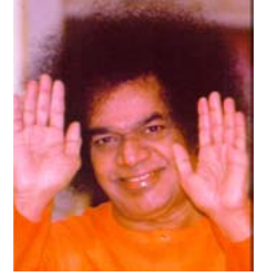
Love All, Serve All

The newsletter is available online at: www.omsaimandir.org