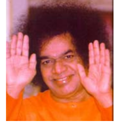
Love All, Serve All

The Monthly Newsletter of Om Sai Mandir July 2004; Volume 1, Issue 1 Guru Poornima/First Anniversary Special Edition saisandesh@omsaimandir.org