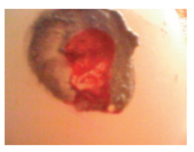
A devotee put the vermillion mark on the Shiva Linga during Rudram Prayers. The dot of vermillion turned into the face of Shirdi Sai Baba. Baba's beard, eyes, face, and cap are clearly visbible.